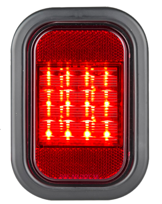
Stop/Tail/Reflector 134RMG - Single Blister

Part No. 59401CPart No. 5940Chrome BktBlack Bkt