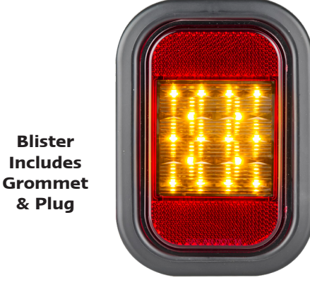
Rear Indicator/Reflector 134AMG - Single Blister